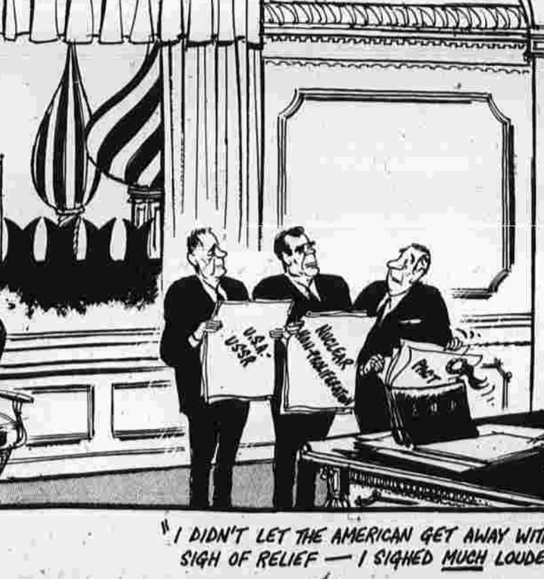
"I DIDN'T LET THE AMERICAN GET AWAY WITH HIS SIGH OF RELIEF — I SIGHED MUCH LOUDER"