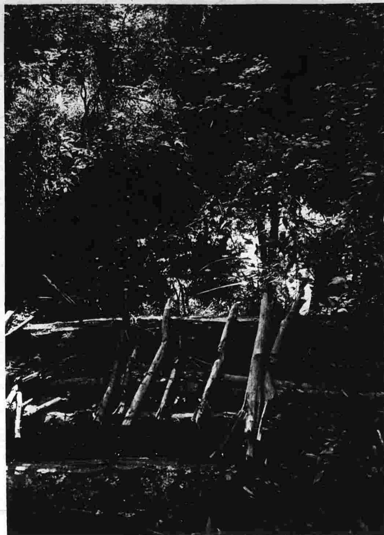
NATURAL BRIDGE, NIPMUCK STATE FOREST, Union